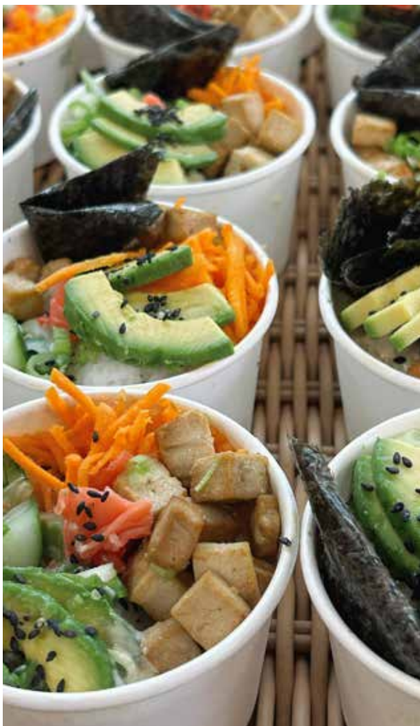
Sushi Bowls from 7 @Avondale

In early 2023, the Avondale University cafeteria was fully refurbished with a whole new approach to provide fresh vegetarian meals for University students and guests on campus. The food is generous, fresh, seasonal, with many plant-based (vegan) and gluten free options. Meals will be a highlight of the Catalyst program where Catalyst participants join with the entire Avondale University student and staff to enjoy meal times, social time and the atmosphere of the refurbished restaurant and café.