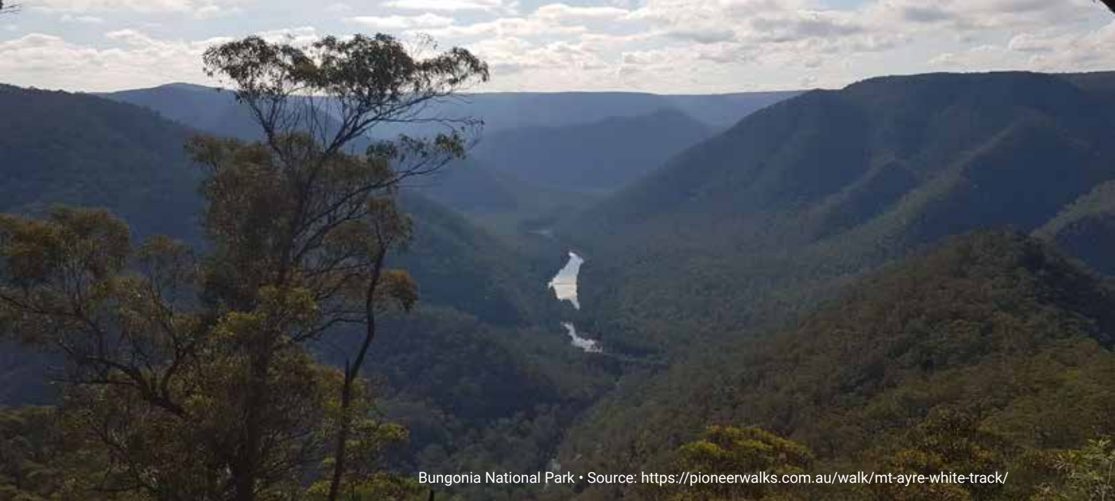
Bungonia National Park